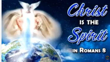
Christ Is The Spirit In Romans 8