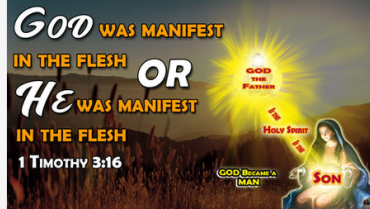
"God was manifest in the flesh" or "He was manifest..."